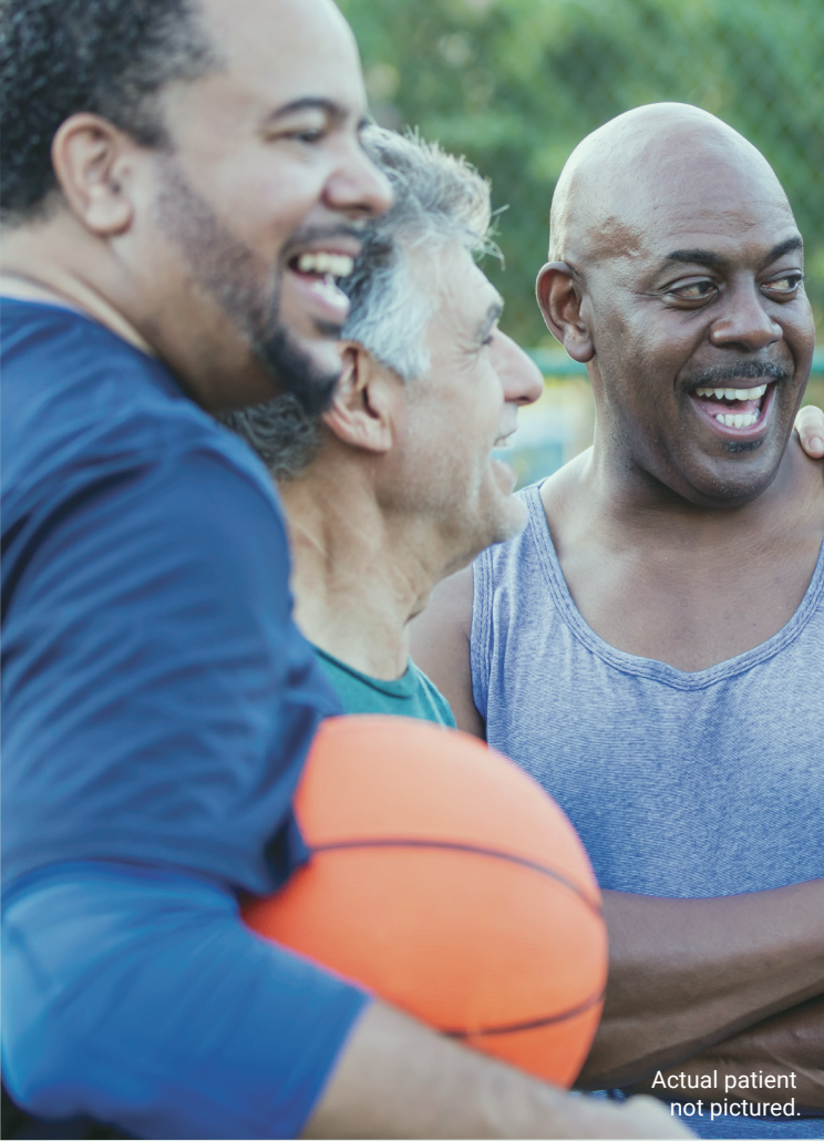
Actual patient not pictured.