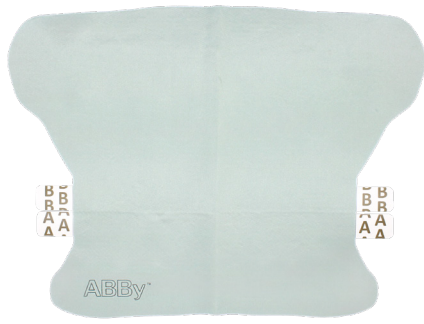
▲ ABBY Panniculus Retractor