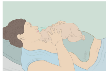
▲ With ABBY

See Instructions for Use for full instructions, warnings, precautions and contraindications.