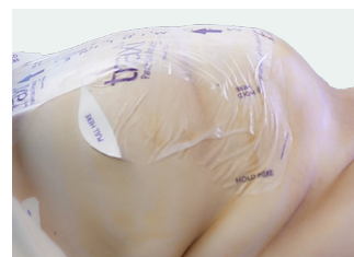
▲ With traxi