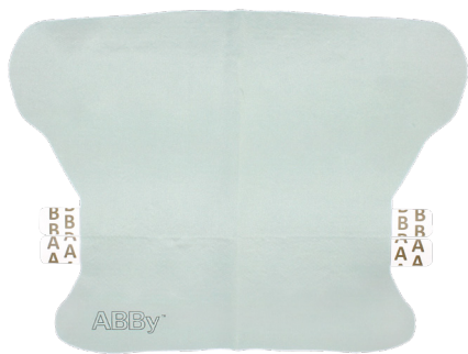
▲ ABBY Panniculus Retraction