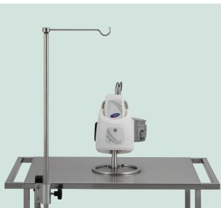
Goby TP Table Top