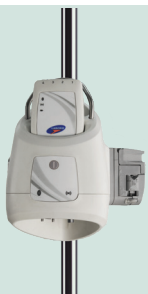
Goby IV IV pole