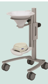
Flowstand Support Urocap IV flowmeter for standing use