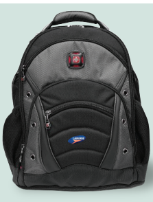
Portable Backpack option