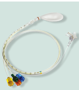
ARM 4-pressure Anorectal Manometry option