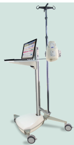
Goby CT Cart