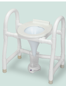
Goby EQ Flow & EMG option