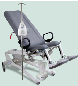
Goby SC Sonesta Chair