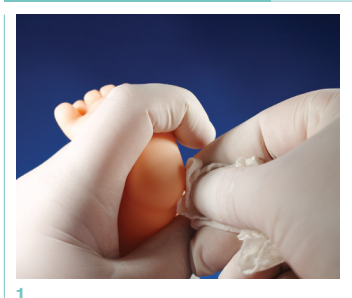
Select an incision site on the flat bottom surface of the heel, then clean the area.