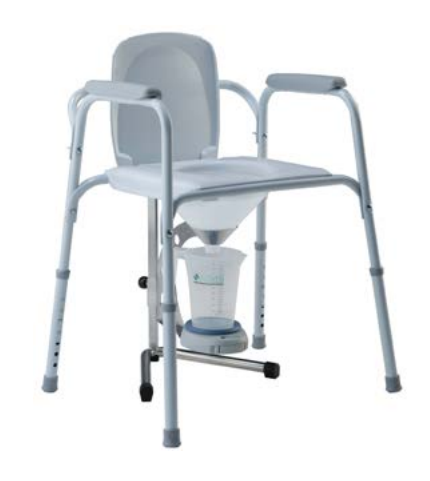
Flowsensor on a height adjustable flow stand under a micturition chair