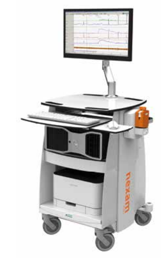
Nexam Pro - wireless professional urodynamics

USA: Tel.: +1 802 857 1300 Email: usmarketing@laborie.com